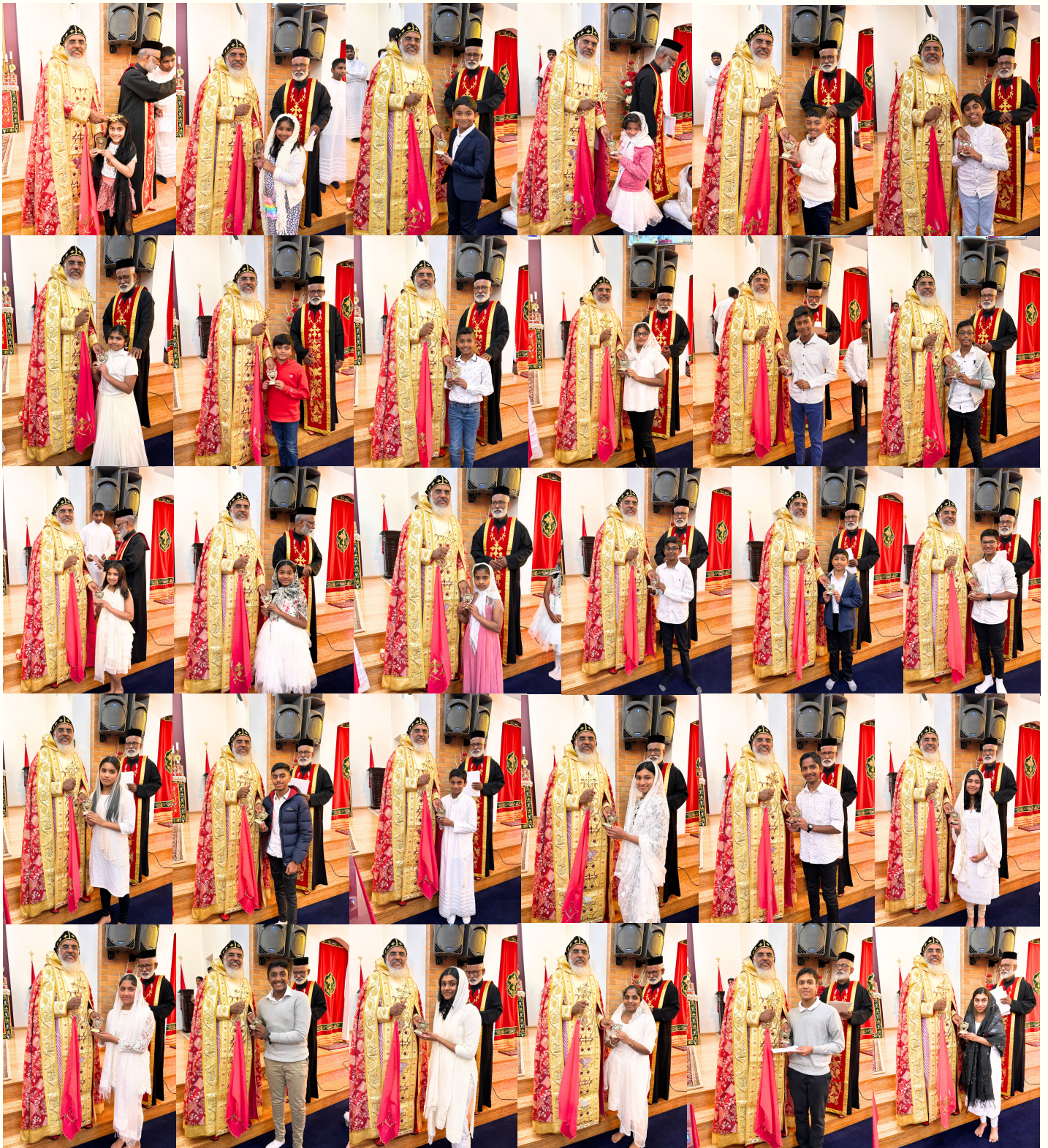
HG also presented trophies of the winners of H H Moran Mar Baselios Marthoma Paulose II Quiz competition 2022.