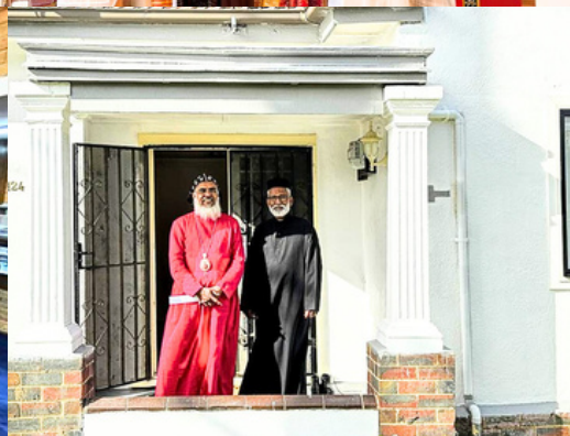
HG with SMIOC Acolytes