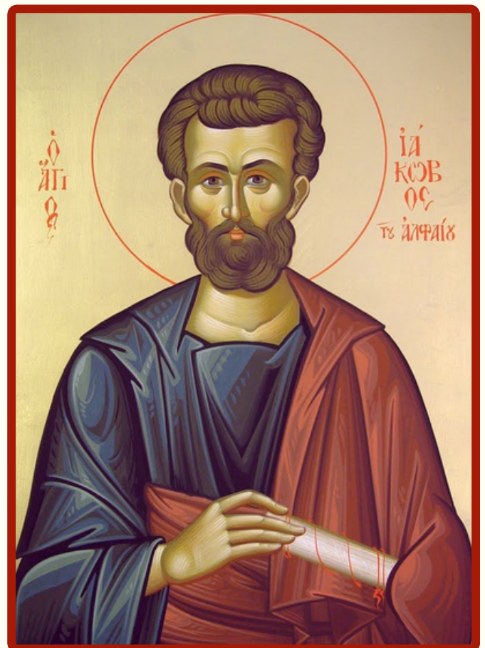
St. JAMES, Son of Alphaeus