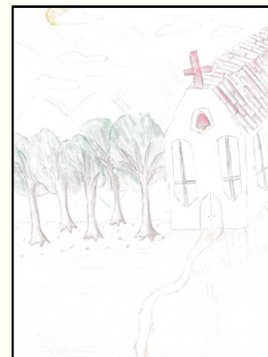
Sheya Shine - Intermediate Drawing - 1st Prize