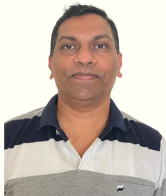
Mr. Thomas Kurian