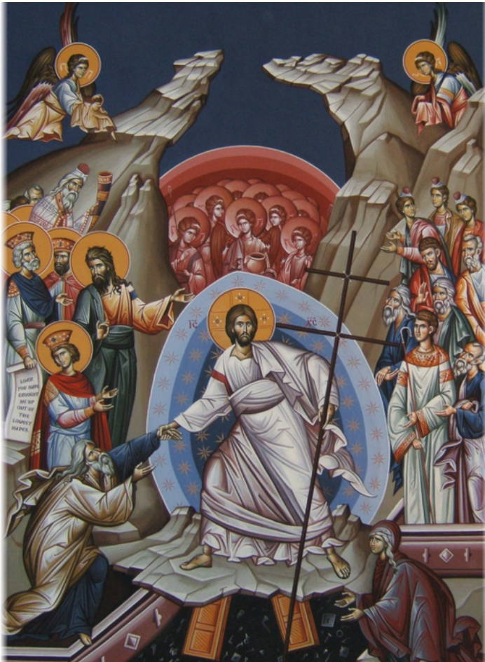
Resurrection of the Christ