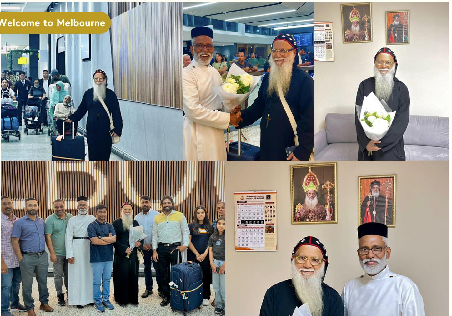
Welcome to Melbourne