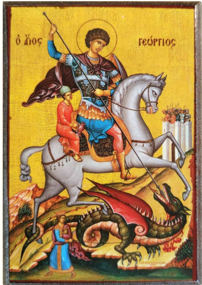
St. George, the Martyr